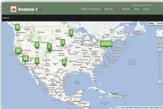
Quickly gain a global perspective on customer activity.

We're all familiar with the expression, "A picture is worth a thousand words." But what if you could take that picture and enhance it through robust, point-and-click data analytics, allowing you to not only "see" your data, but also get quick answers to your most pressing questions? It's through this revolutionary marriage of data mapping and data analytics that you can focus strategic decisions with laser-like precision.