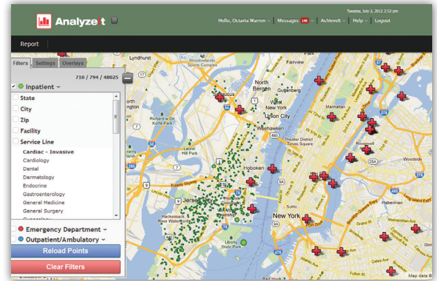
Plot individual data points and overlay market variables.